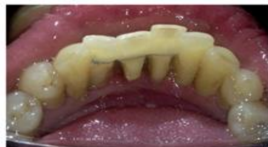
Fig. 4: Composite Splinting with Wire