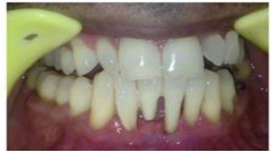
Fig. 6: Post Operative after 4 Weeks