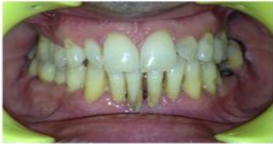
Fig. 1: Before SRP

This immediate provisional restoration allows for exact repositioning of the coronal part of the extracted tooth in its original intraoral three dimensional position and thus relieves the apprehension of the patient caused by the sudden loss of an anterior tooth. Thus this procedure to a great extent helps in regaining esthetics and providing patient satisfaction. Appropriate patient education and instruction to clean the gingival embrasures and avoid having heavy bite is very critical and important.