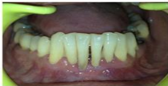
Fig. 2: 4 Weeks Post SRP