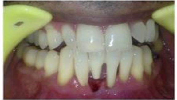
Fig. 5 Natural Tooth Pontic