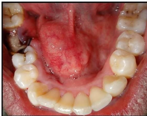
Fig. 1: Clinical Presentation of a Swelling