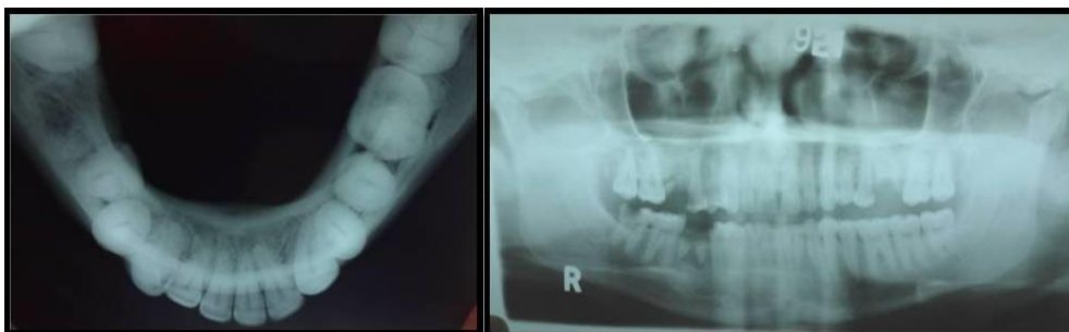
Fig. 2: Occlusal and panoramic images