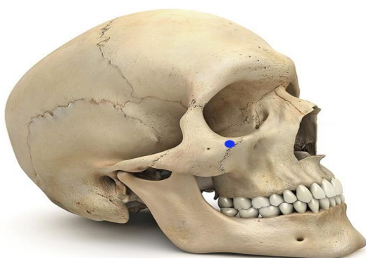
Fig. 1: Centre of Resistance of Maxilla