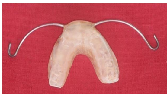
Fig. 2: Intra Oral Splint