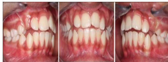
Fig. 5: Post Treatment Intraoral View