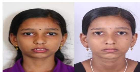
Fig. 6: Frontal View-Pre and Post Treatment Photographs