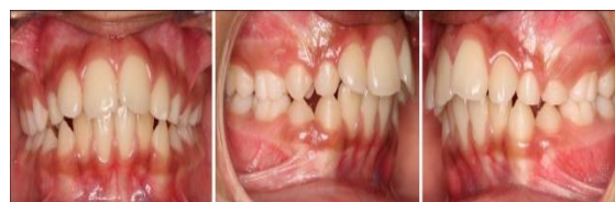
Fig. 4: Pre Treatment Intraoral View