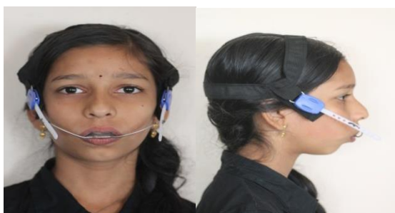
Fig. 3: Patient with High Pull Headgear