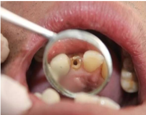
Figure 10: Post space Preparation.