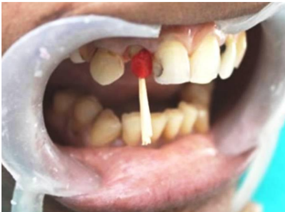
Figure 15: Fabrication of resin pattern.