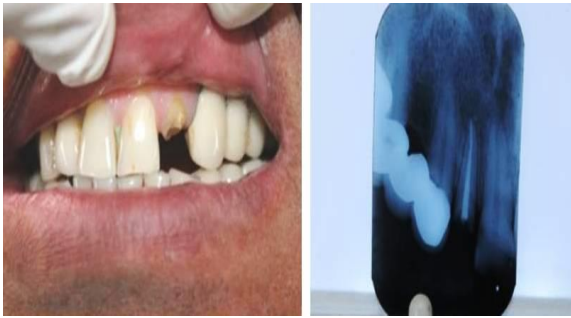
Figure 9: Intra Oral view with preoperative Radiograph.