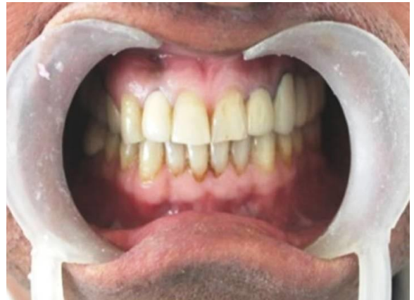
Figure 13: Final prosthesis cemented.