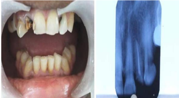
Figure 14: Intra Oral view with preoperative Radiograph.