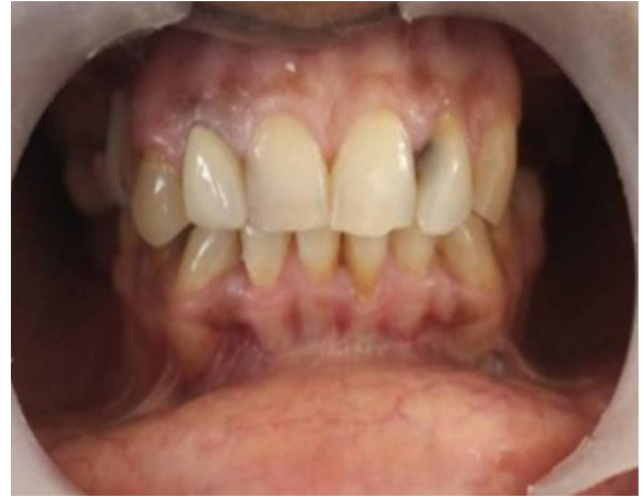
Figure 17: Final prosthesis cemented.