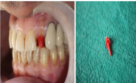
Figure 11: Resin Pattern Fabrication of post and core.