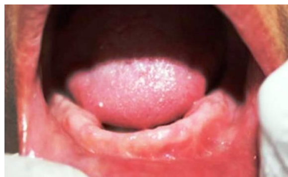
Figure 2: Pre-operative view Mandible.