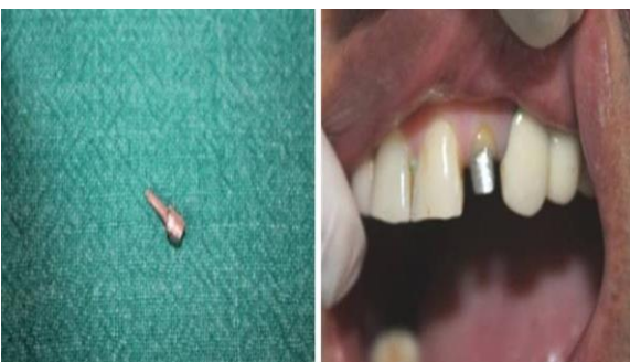
Figure 12: Custom cast post retrieved and was cemented in patient's mouth.