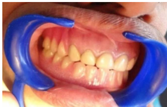
Figure 8: Anterior crown cemented in the patient's mouth.