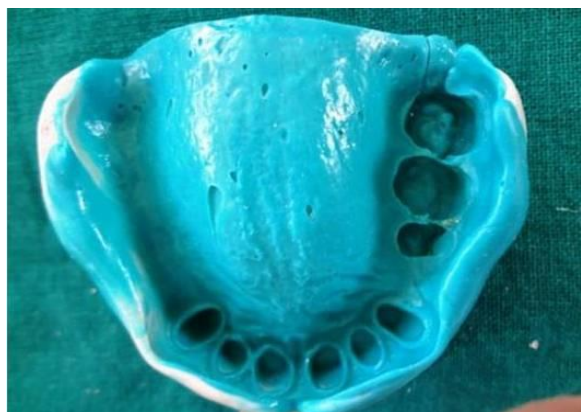
Figure 5: Final Impression.