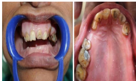
Figure 1: Frontal and Occlusal Pre-operative view of maxillary arch.