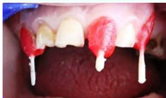
Figure 3: Plastic Tooth picks and Resin post & core patterns (intra -oral)