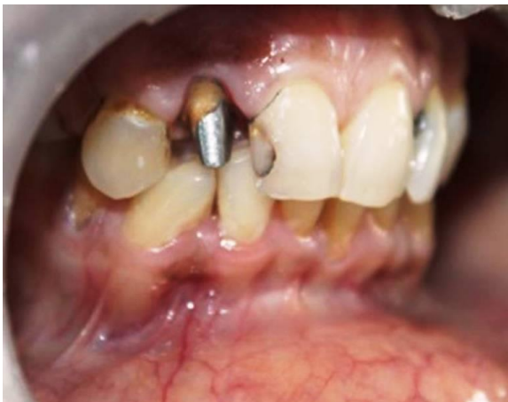
Figure 16: Custom cast post cementation.