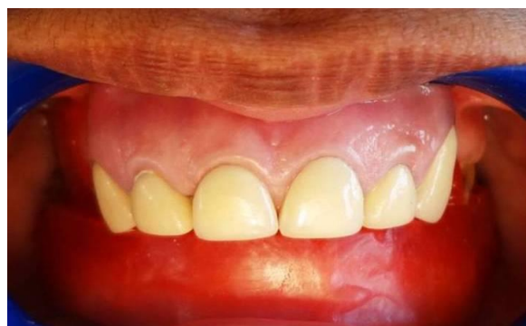
Figure 7: Jaw relations.