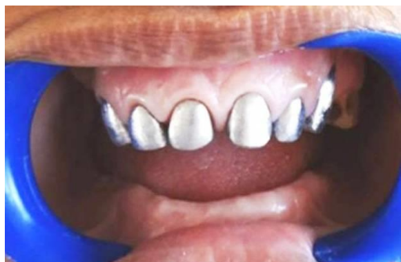
Figure 6: Metal try-in stage.