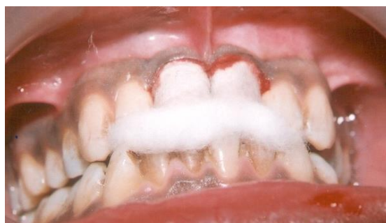
Fig. 5: Patient asked to bite by placing cotton in between the teeth