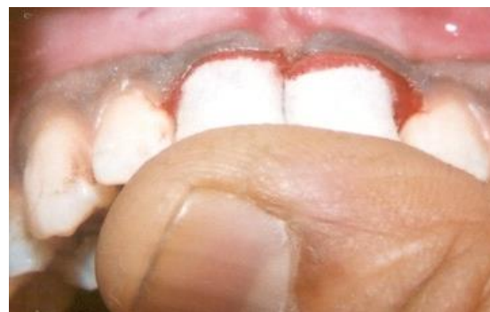
Fig. 4 Retracting gingiva by blotting rolls using Finger pressure