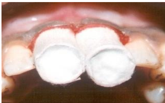
Fig. 2: Placement of blotting paper rolls on anterior central incisors packed with cotton dipped in aluminium chloride