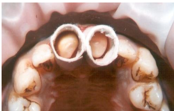
Fig. 3: Top View of anterior teeth with blotting rolls