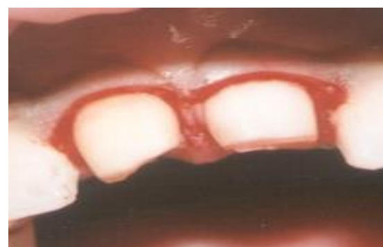
Fig. 6: Central incisors showing retracted gingiva