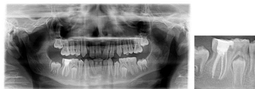
Fig. 3: The OPG revealed the total healing of the lesion with respect to #46