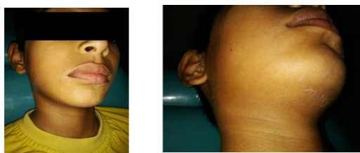
Fig. 2: Shows clinical picture of extraoral view of patient the hard bony swelling had completely disappeared

The root canal was irrigated between instrumentation with 2.5% sodium hypochlorite. The canal was dried, calcium hydroxide was placed in the canal, and a sterile cotton pellet was sealed in the pulp chamber with interim restoration (cavitG). At the next appointment 2 weeks later, the patient had an absence of pain on palpation and there was a reduction in the swelling on the right side of the mandible. Intracanal medicament was changed and followed by the interim restoration and patient was recalled after 3 months. On the next visit the hard bony swelling had completely disappeared (Fig. 2) and the endodontic treatment was completed using apexit plus as a root canal sealer. An OPG was taken for which revealed the total healing of the lesion with respect to #46. (Fig. 3)