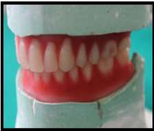
Fig. 14 b