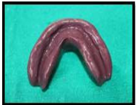
Fig. 2: Primary impressions using McCord and tayson technique