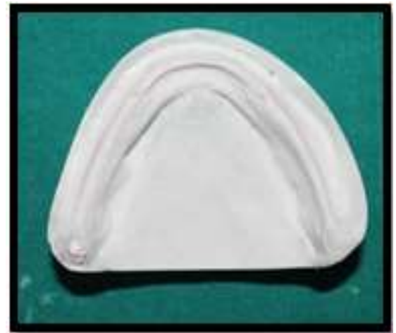
Fig. 8: Master casts