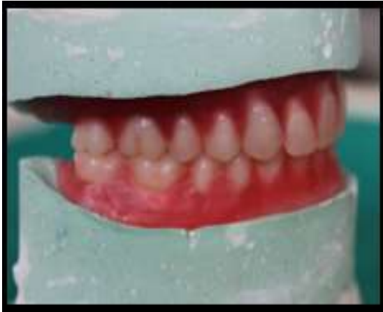
Fig. 14 a