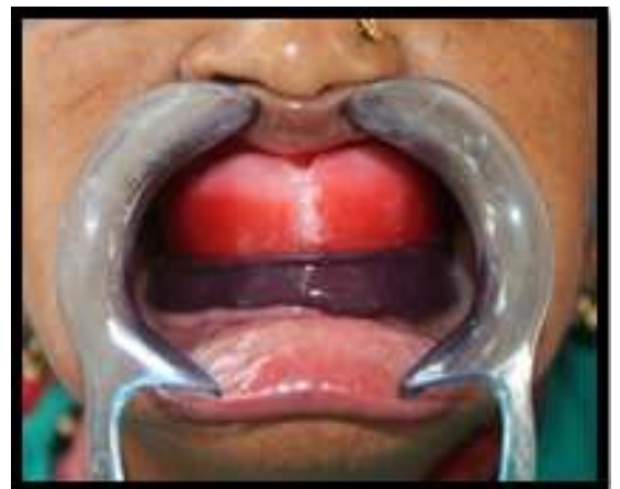
Occlusal rim in patient's mouth