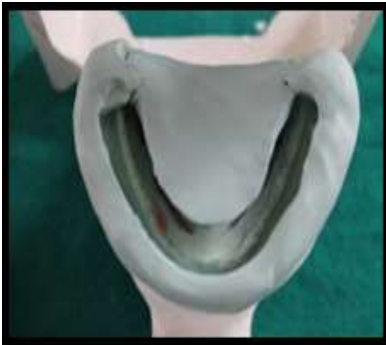
Fig. 13 a