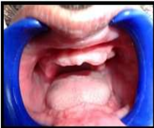
Fig. 1c: Shows maxillary and mandibular edentulous ridges