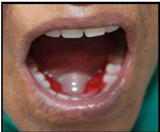
Fig. 15 b: Try-in in patient mouth