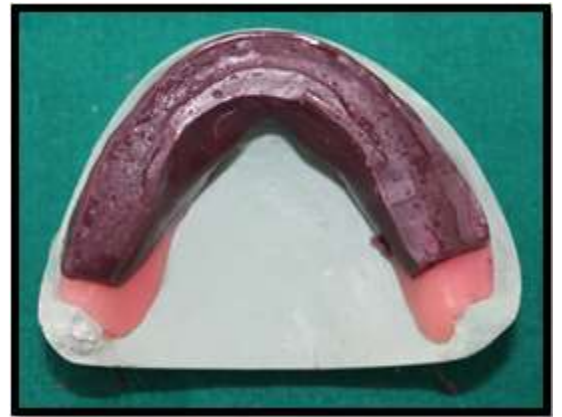
Fig. 11: Mandibular rim adjusted according to the vertical