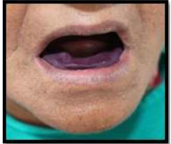
Fig. 10 d

Neutral zone recording using impression compound