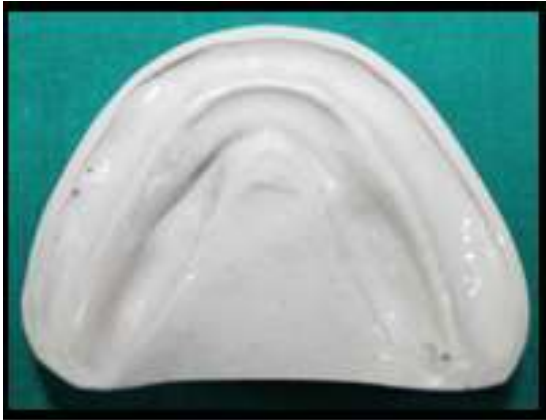
Fig. 3: Primary maxillary and mandibular casts