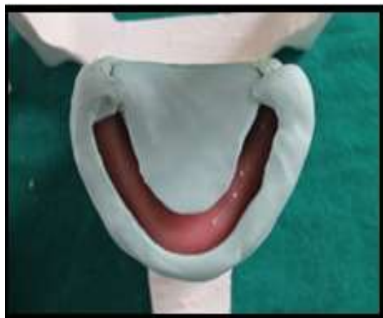
Fig. 13 b: Molten wax poured to fabricate rim in neutral zone