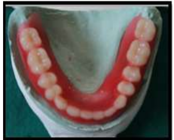
Fig. 14 d: Teeth arrangement in neutral zone