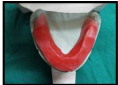
Fig. 13 d: Molten wax poured to fabricate rim in neutral zone recorded in occlusal rim