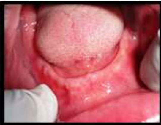
Fig. 1 b: Edentulous Mandibular Ridge