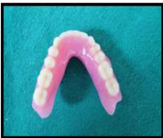
Fig. 16 a: Final mandibular prosthesis