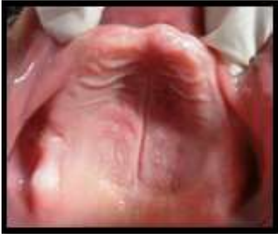
Fig. 1 a: Edentulous maxillary ridge