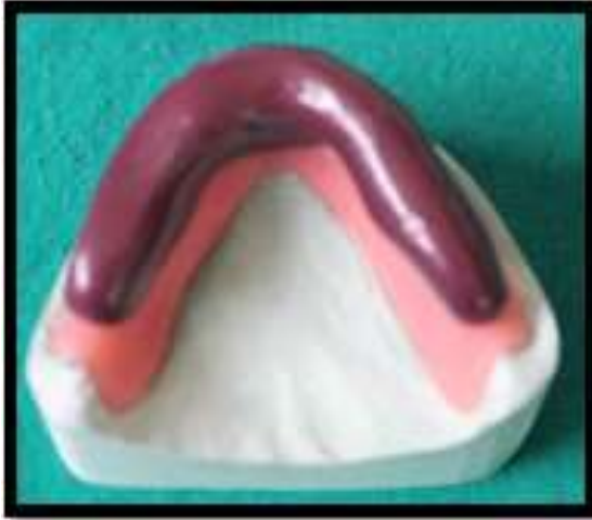
Fig. 10 a