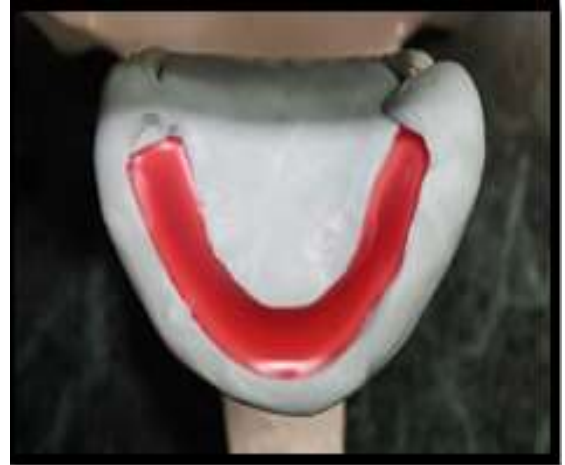
Fig. 13 c