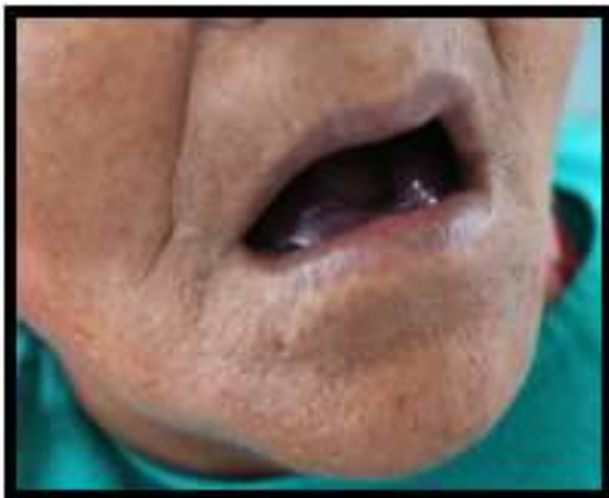
Fig. 10 c