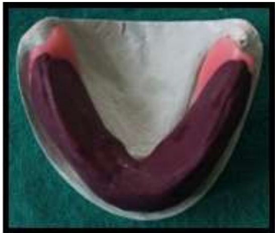
Fig. 10 b

Neutral zone recording using impression compound