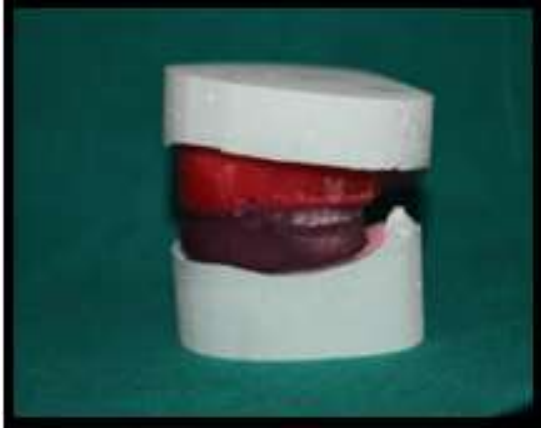
Fig. 12: Jaw relations