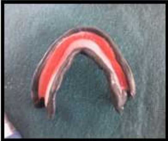
Fig. 6: Border moulding