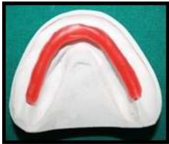
Fig. 4: Maxillary spacer Mandibular double spacer