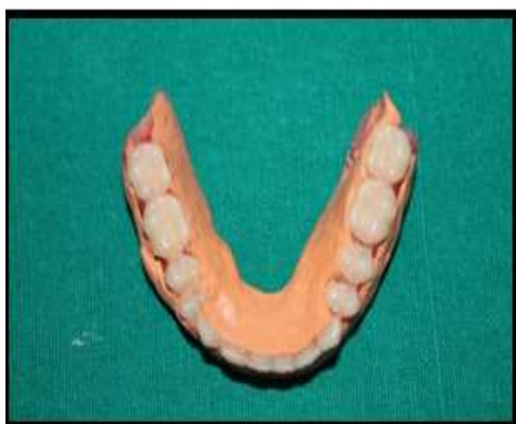
Fig. 15 c: External functional impression recorded