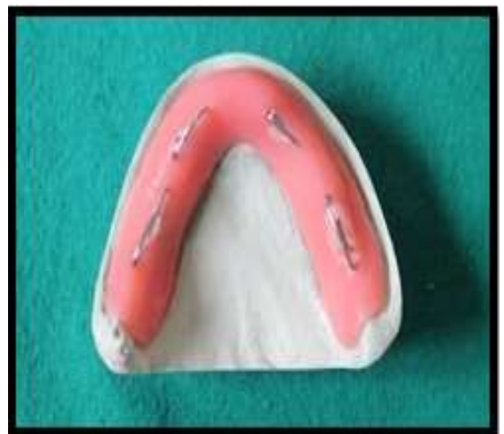
Fig. 9: Incorporation of retention loops in mandibular denture base