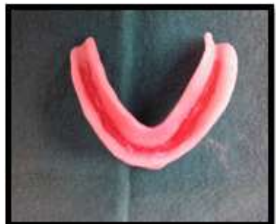
Fig. 5 Removal of Maxillary and mandibular custom tray