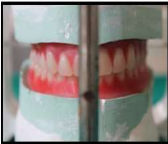
Fig. 14 c