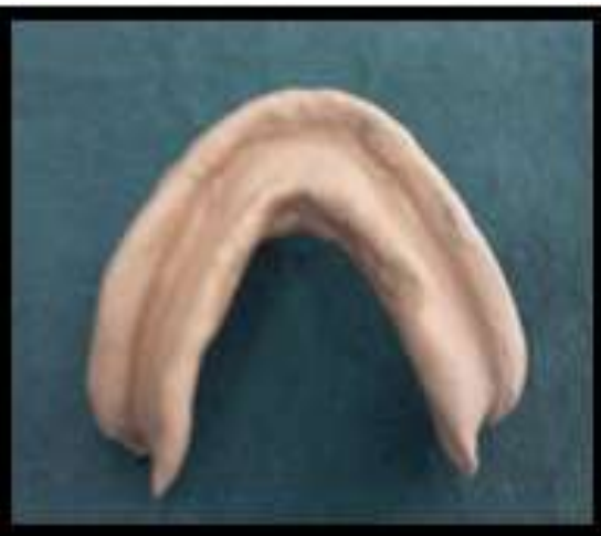
Fig. 7: Secondary impression