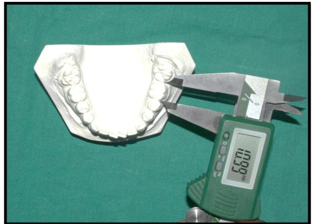
Figure 2: Tooth width measurement using vernier caliper

measured at the width area of contact point on proximal surfaces (Figure 1). Measurements were taken parallel to occlusal surface and perpendicular to the long axis of the tooth (Figure 2).