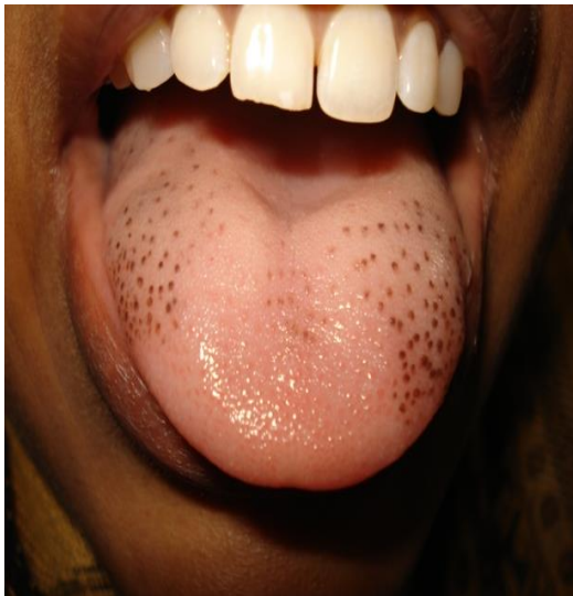
Fig. 1: Black pigmented lesions on the dorsum and lateral border of tongue: Pigmented Fungiform Papilla of the tongue (PFPT)

The patient was reassured of the benign nature of the condition and tablet iron and folic acid once a day was given for 6-months.