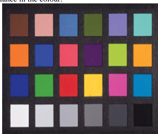
Colour checker chart

An accurate colour chart is needed when photographing the bite mark to ensure correct colour calibration when using a computer. For consistent results a colour chart should be visible in every image that is taken because slight changes in the distance between the flash and subject will have an influence on brightness within the image and will create slight variance in the colour.