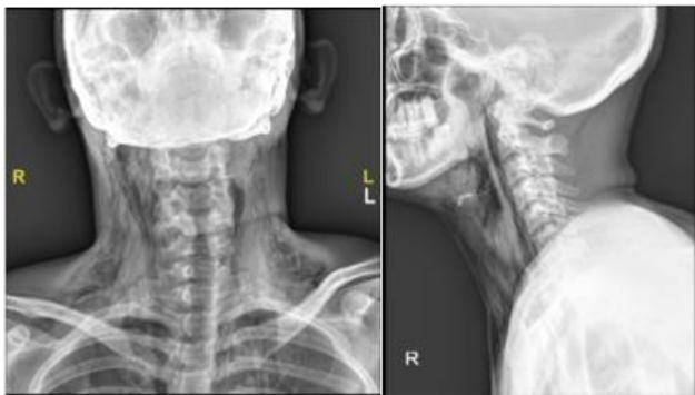
Fig. 4: Radiolucency with air density at bilateral colli in neck soft tissue photo

Test) Anti SARS-CoV-2 was non-reactive. In blood gas analysis there was decrease of pO 2 and Saturation. In thorax X- Ray on (Figure 3) there was radiolucency of air density in colli to bilateral shoulder, with impression subcutaneous emphysema at region colli bilateral, there was no bronchopneumonia and cardiomegaly. On neck soft tissue photo on (Figure 4) there was radiolucency with air density at bilateral colli and air column still open.