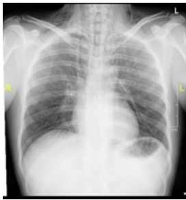
Fig. 3: Thorax x-ray

Test) Anti SARS-CoV-2 was non-reactive. In blood gas analysis there was decrease of pO 2 and Saturation. In thorax X- Ray on (Figure 3) there was radiolucency of air density in colli to bilateral shoulder, with impression subcutaneous emphysema at region colli bilateral, there was no bronchopneumonia and cardiomegaly. On neck soft tissue photo on (Figure 4) there was radiolucency with air density at bilateral colli and air column still open.