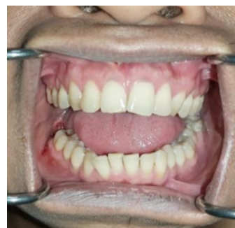
Fig. 2: Intra oral of the patient, showed unfinished tooth extraction of mandibular second molar and limited mouth opening of the patient

In laboratory finding, hematology was normal, chemical blood component was normal. Covid-19 Screening (Rapid