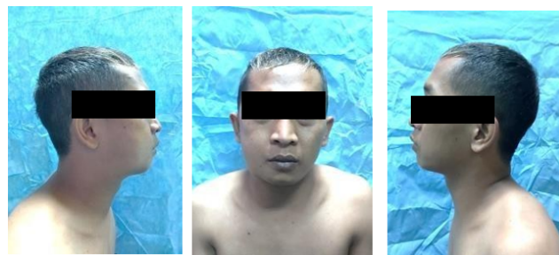
Fig. 1: Profile photos of the patient showed clinical condition of the patient first arrived on emergency room

In extra oral examination (Figure 1) there was an asymmetrical face, swelling at right lower jaw extended to neck and chest region with 8 x 3 x 2 cm, with characteristic of the swelling was localized, no fluctuation, no redness, no febrile temperature on the site of swelling and there was crepitation and pain on palpation. In intra oral examination (Figure 2), there was found hyperemia at gingiva of tooth 47 region, with an open gingiva looked like dissected gingiva and the tooth had not been extracted yet. In examination of lip, tongue, palate, vestibule, floor mouth, buccal mucous, were normal, and tonsil was difficult to be assessed. On clinical examination and panoramic x-ray (Figure 5), we found third molar impaction of teeth 38, pulpitis irreversible of teeth 37, pulpitis reversible of teeth 36, apical periodontitis of teeth 47 and missing of tooth 48. Mouth opening was limited with 1.5 cm, and there was calculus all over region.