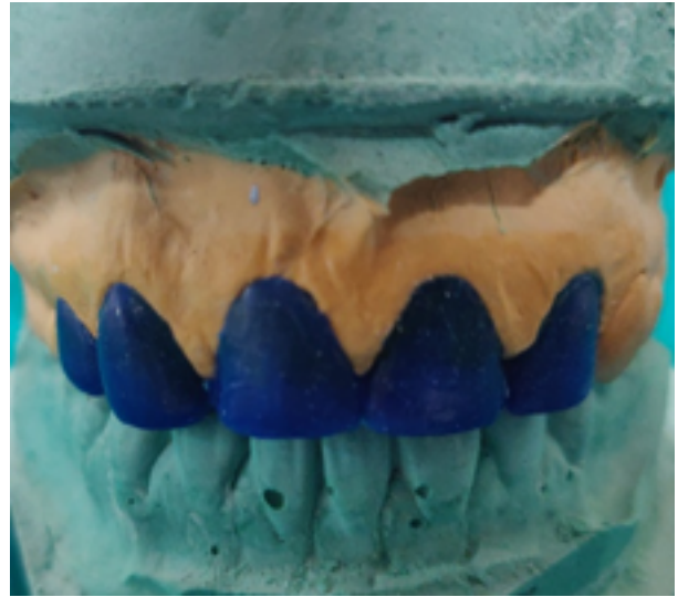
Fig. 2: Diagnostic wax-up and mock-up