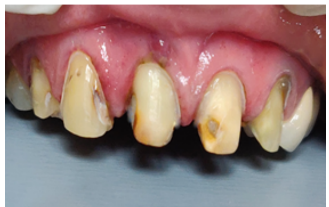
Fig. 4: Minimally prepared 14 12 11 21 22 for receiving laminate veneers