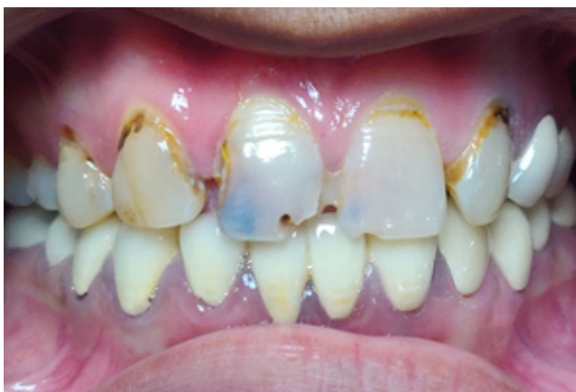
Fig. 1: Clinical intraoral examination showing discolored maxillary anterior teeth with diastema between 12 & 11 and 21 & 22