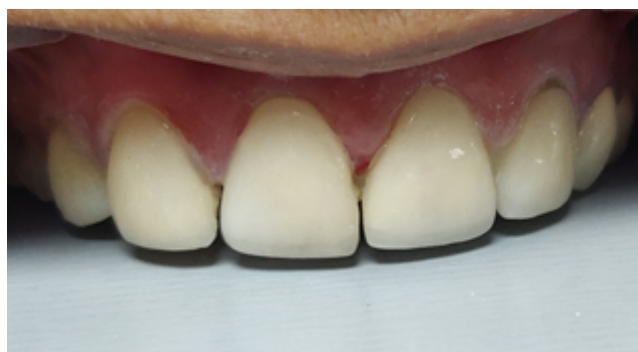
Fig. 5: Laminates checked in the patient's mouth for form, function and occlusion