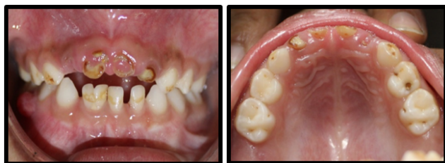
Fig. 1: Showing grossly carious 51,52,61,62

Stainless steel crown. GIC restoration with 55,64 and 65. Extraction of 51, 52, 61 and 62 followed by fixed functional space maintainer.