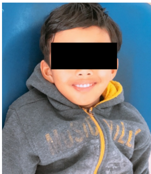
Fig. 6: Facial view postoperatively