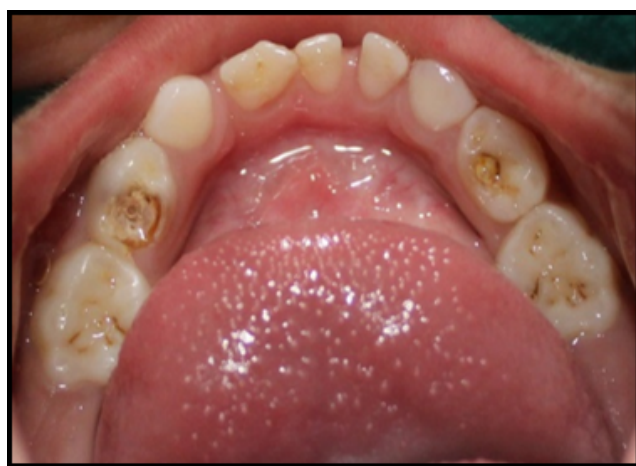
Fig. 2: Preoperative mandibular view