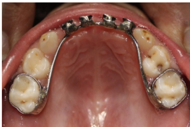
Fig. 4: Metal trial of appliance with 4 brackets in anterior region