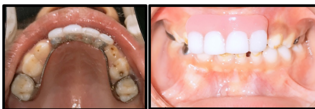
Fig. 5: Postoperative photograph after the placement of appliance