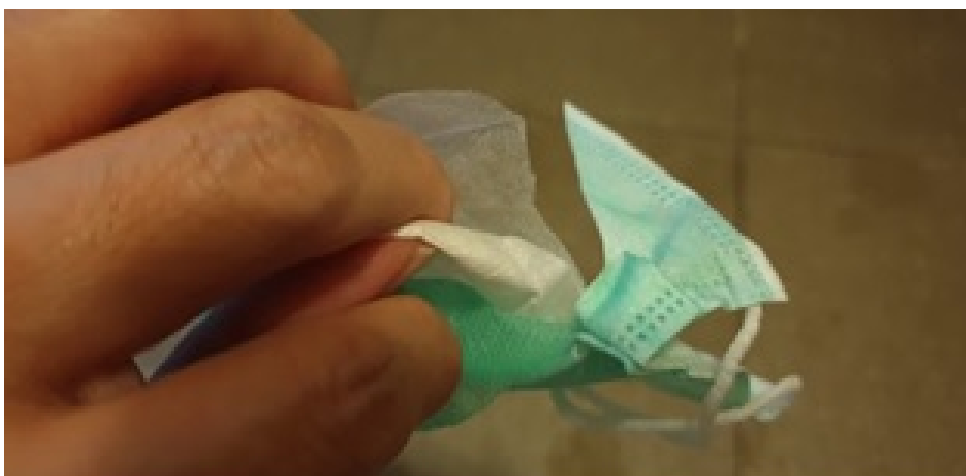
Fig. 4: Layers of 3-ply mask