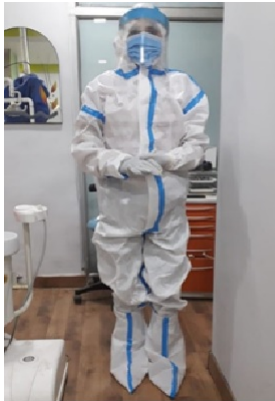
Fig. 3: PPE