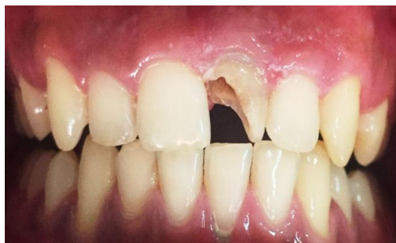
Fig. 1: Preoperative clinical photograph

Maillefer, Ballaiguise, Switzerland) with AH Plus resin sealer (DentsplyDeTrey, Konstanz, Germany) ( Fig. 5 ). The tooth was immediately restored with a composite restoration (Tetric N Ceram, Ivoclar Vivadent, Schaan, Liechtenstein) and in subsequent visits an all ceramic crown was placed ( Fig. 6a, 6b ). During six months follow up the patient remained asymptomatic with restored aesthetics and functions.