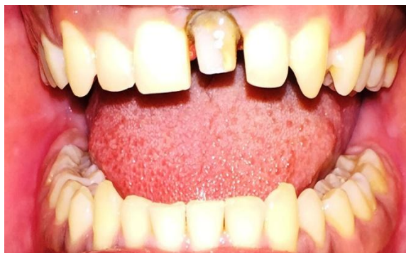
Fig. : 6(b)