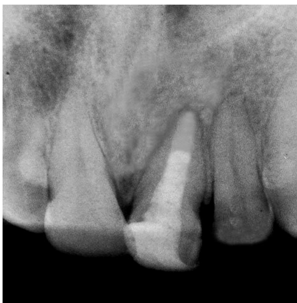
Fig. 5: Backfill with thermoplastised guttapercha and restored with composite