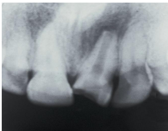
Fig. 2: Preoperative radiograph