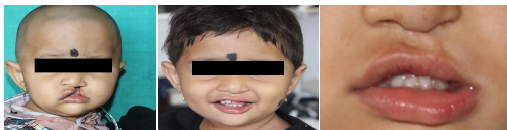
Fig. 5: Pre op and post op Photographs. Note the well formed lip architecture with good scar characteristics

The surgical results of 11 (36.66%) patients were EXCELLENT and 19(63.33%) patients were adjudged to have a GOOD esthetic outcome.