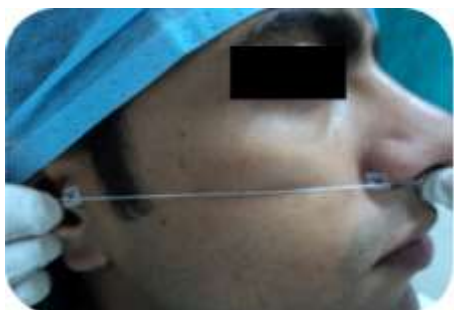
Fig. 3: Swelling assessment (ALA of Nose to Tragus)

Swelling: Facial measurements were taken pre-operatively and post-operatively using a black suture material and a ruler, recorded in millimeters. Swelling will be measured by marking four points on the patient's face i.e. ala of the nose, tragus of the ear, gonion and menton (Fig. 3, 4).