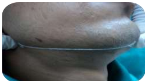
Fig. 4: Swelling Assessment (Gonion to Menton)

Trismus: Distance between the incisal edges of the maxillary and mandibular central incisors was measured when the mouth was open to the full extent. The amount of trismus was taken as a difference in the maximum opening of mouth before and after surgery using divider and a ruler in millimeters (Fig. 5).