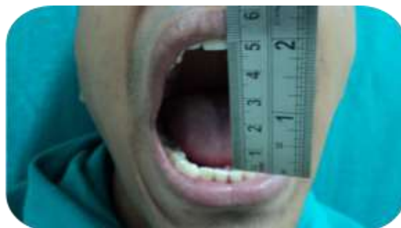
Fig. 5: Inter incisal mouth opening assessment (for trismus)

Trismus: Distance between the incisal edges of the maxillary and mandibular central incisors was measured when the mouth was open to the full extent. The amount of trismus was taken as a difference in the maximum opening of mouth before and after surgery using divider and a ruler in millimeters (Fig. 5).