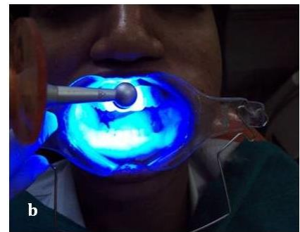
Fig. 5: (b)