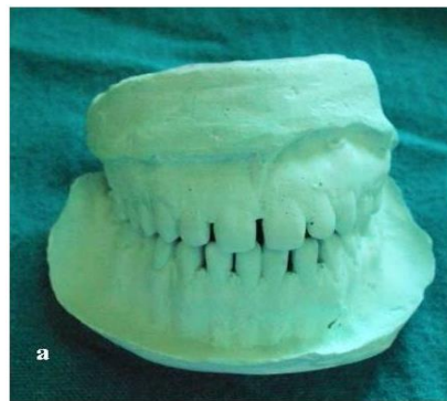
Fig - 2(a)

Impressions were made and models prepared. A diagnostic wax up of the models was performed to modify and finish them to predictable esthetics for the patient (fig.2a-b). The waxed up modified models were then duplicated. The duplicated casts were then placed in a Biostar machine. The matrix material selected was copyplast 1 mm (Scheu Dental GmbH Am Burgberg 2058642 Iserlohn Germany). Copyplast is a low density polyethylene (PE-LD) biocompatible material available in 1mm and 1.5mm round and 0.5mm, 1mm, and 1.5mm square. Copyplast is ideal for fabricating a temporary matrix. The matrix was fabricated and trimmed to be used in the patient's mouth (fig.3a-b).