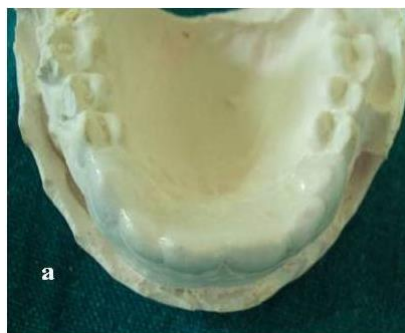
Fig - 3(a)