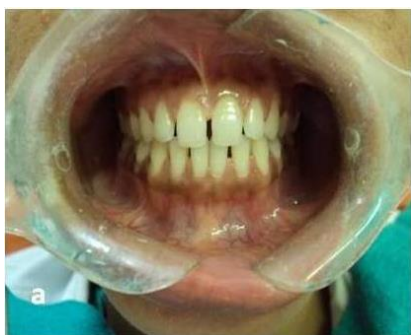
Fig - 1(a)

Closure of midline diastema and overall smile build up using a customized matrix technique.