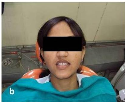
Fig - 1(b)