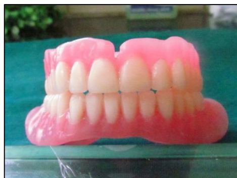
Fig.5: Dentures in occlusion