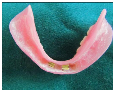
Fig.4: Metal encapsulator and retention clips transferred to denture base