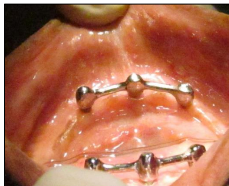
Fig.3: Bar in situ.

The next day impressions were made, lab analogs attached and the impression poured. A customized framework of copings and bar was fabricated over the analogs in self-cure acrylic resin. This framework was tried in the patient's mouth, cast, polished and tried again intraorally. The framework was cemented with dual cure resin cement (Fig.3). Retention clips and metal encapsulators were placed over the bar and then transferred to the undersurface of the mandibular denture where adequate space had been created for this attachment assembly (Fig.4). The dentures were tried and minor adjustments done. They were then finished and polished (Fig.5). The patient was trained in insertion and removal of the denture and educated in denture care. Oral hygiene instructions were given. The follow up protocol included routine checkups every month. Hygiene maintenance was regularly reinforced. The patient was extremely satisfied with her new set of dentures (Fig.6).