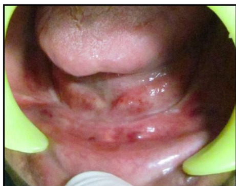
Fig.1: Pre op photograph showing severely resorbed mandibular ridge