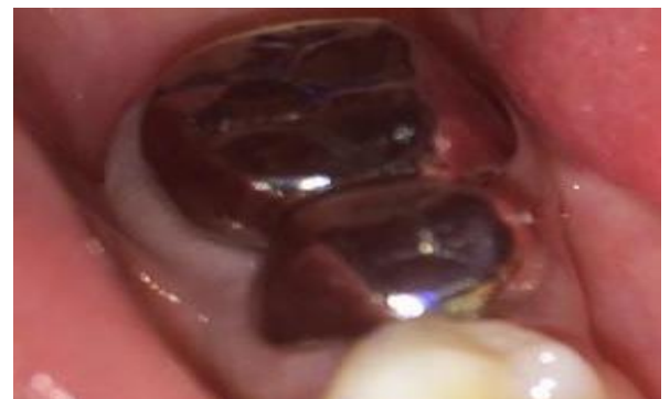
Fig. 3: Metal crown cementation