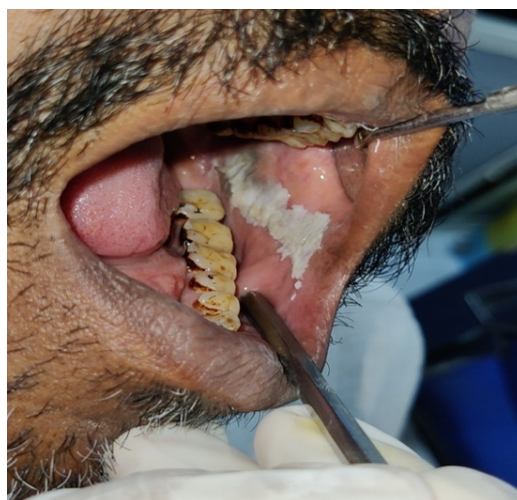
Fig. 8: Homogenous leukoplakia on left buccal mucosa

A 47-year old male patient reported to OPD of Dental College and Hospital with a chief complaint of pain in lower right posterior region of the jaw. Examination revealed severe occlusal caries with 46 with a periapical abscess. Clinical examination also revealed presence of a single, raised, well-defined non-scrappable, linearly spread, densely keratotic plaque for which a diagnosis of homogeneous leukoplakia was made. Vital staining was performed using toluidine blue staining. There was heavy uptake of stain indicating higher indicating a higher risk of dysplastic changes. Incisional biopsy was performed under local anesthesia. Histopathological examination revealed presence of a hyperkeratotic lesion with mild dysplasia. Complete excision was done using Zolar™ photon diode laser of wavelength 810nm with entire set up including fiber stripper, fiber cleaver and protective eyewear using pulse mode. The laser unit was operated by a well -functioning foot control machine and the entire extent of the lesion was ablated steadily with a smooth finger grip. Follow up post 15 days after surgery revealed that healing was satisfactory and patient was completely asymptomatic. Antibiotic cover was prescribed for 5 days.