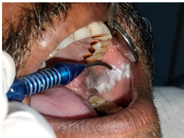
Fig. 11: Laser excision of lesion