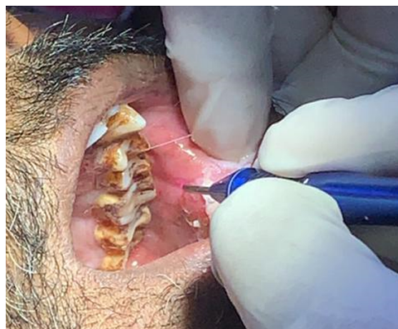
Fig. 4: Laser excision of the lesion