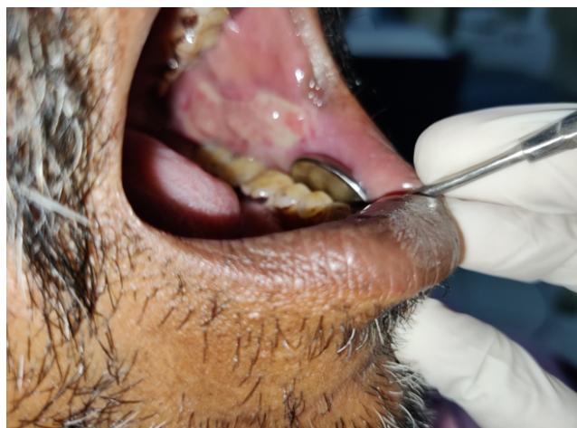
Fig. 13: Healing of oral mucosa 5 days after surgery