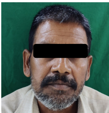
Fig. 7: Profile of the patient