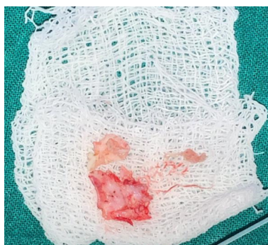
Fig. 6: Charred tissue obtained from the lesion