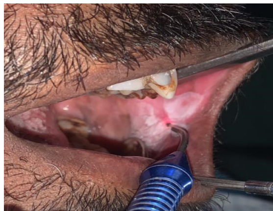
Fig. 3: Laser excision of the lesion