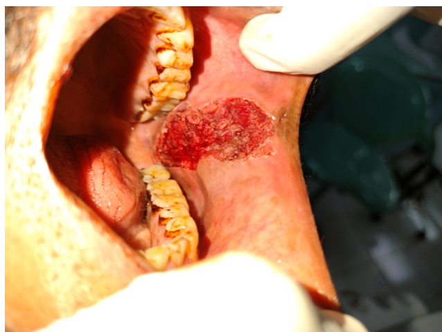
Fig. 12: Oral mucosa post laser excision