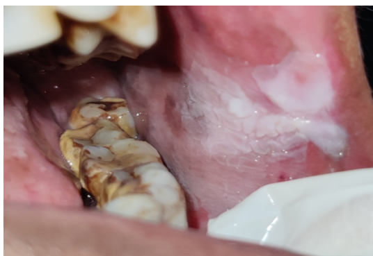
Fig. 2: Leukoplakia on left buccal mucosa