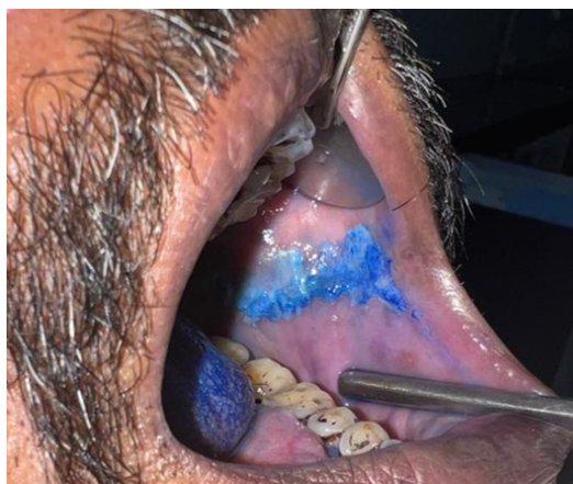
Fig. 10: Toluidine blue staining of the lesion