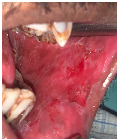
Fig. 5: Surface of mucosa immediately after excision