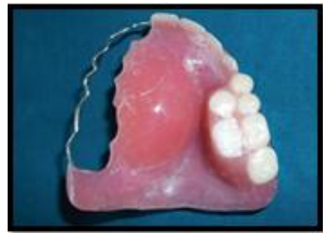
Fig. 2: A guide plane prosthesis

to compensate for the deviation that can provide a surface against which the artificial teeth of the residual segment can occlude.