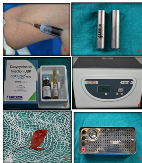
Figure 1: a): 20ml of blood is withdrawn from antecubital vein; b): Titanium tubes were used for preparation of PRF; c): 2ml of Doxycycline solution was added to test group prior to centrifugation; d): The tubes were immediately centrifuged at 2700 rpm for 12 min; e): T-PRF clots were removed from the tubes via sterile tweezers; f): Compression was done to form membrane

tubes via sterile tweezers, separated from the red blood cells, and placed on sterile woven gauze. Compression was done to form membrane. For preparation of T-PRF loaded with doxycycline, 2 mL of Doxy solution at 3 mg/mL concentration was injected into the T-PRF tube immediately prior to centrifugation. Physical properties assessed by measuring the length (tested by compression) of the PRF clot. (Figure 1) The antibacterial activities of the prepared T-PRF, T-PRF/ Doxy were investigated by employing the disc-diffusion technique against P. aeruginosa ATCC 10,145 and S. aureus ATCC 6538. Bacterial stock culture was revived in 10 mL of nutrient broth for 24 h in a 35 °C incubator. Immediately, 5 mg of T-PRF, T-PRF/Doxy was transferred onto the nutrient agar. The plates were incubated at 35 °C in an incubator for 24 h. The next day, the inhibition zone diameters (IZD, mm) was measured.